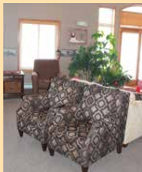
Interior of Prairie Sunset Village, MRH&C's assisted living and senior housing facility

Some may ask why the hospital is interested in getting involved in this process. The short answer: to support the hospital's mission in providing access to high-quality healthcare to all people in our region. If long-term care needs