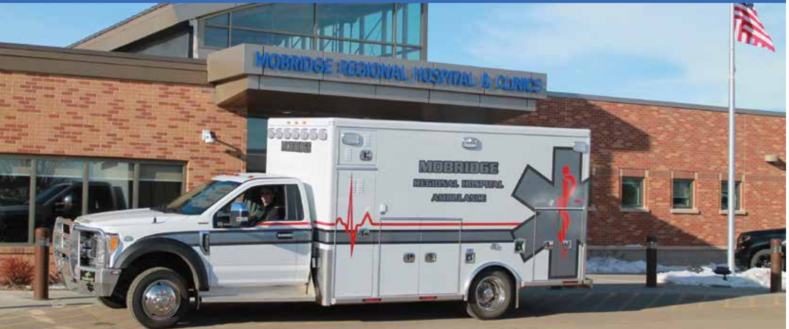
Mobridge Regional Hospital & Clinics recently purchased a new 4x4 ambulance to better serve our community. The emergency vehicle was necessary when considering the weather and demand of our rural areas.

Mobridge Regional Hospital & Clinics takes the responsibility of caring for the health and well-being of the community very seriously. We hear you — you provided your input in 2019 through our Community Health Needs Assessment, and we took it to heart to come up with an implementation strategy heading into 2020 and beyond.