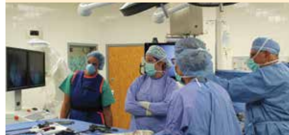
New equipment in the operating room makes for better visualization.