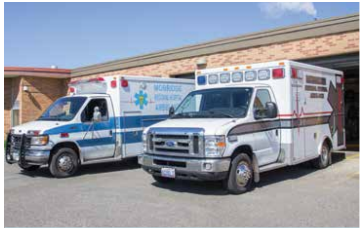
Four MRH&C ambulances and a large EMS team are at the ready 24/7.

Most trauma and emergency cases can be cared for right here at home. On rare occasions (less than 4% of the time) a patient needs advanced specialty care and needs to be transferred out. When this happens, the hospital calls on a fixed wing plane, helicopter, or ambulance to quickly transport patients to Bismarck, Fargo, Aberdeen, or Minneapolis.